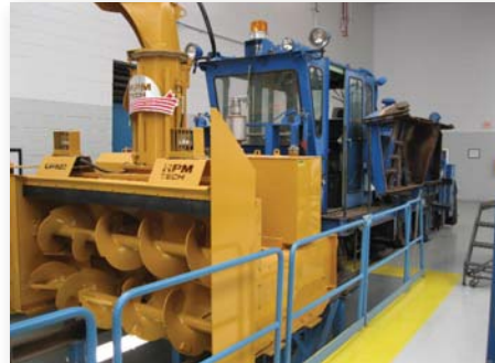
LM220 Detachable Snow Blower Mounted on a Ballast Regulator