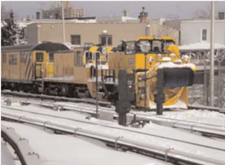
SRS Rapid Snow Removal System