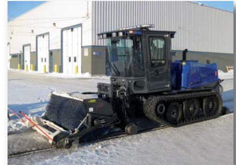
CAMELEON® Hi-Rail Road/Rail Multitask Vehicle

Note: The carrier unit may differ from the ones shown in this brochure.