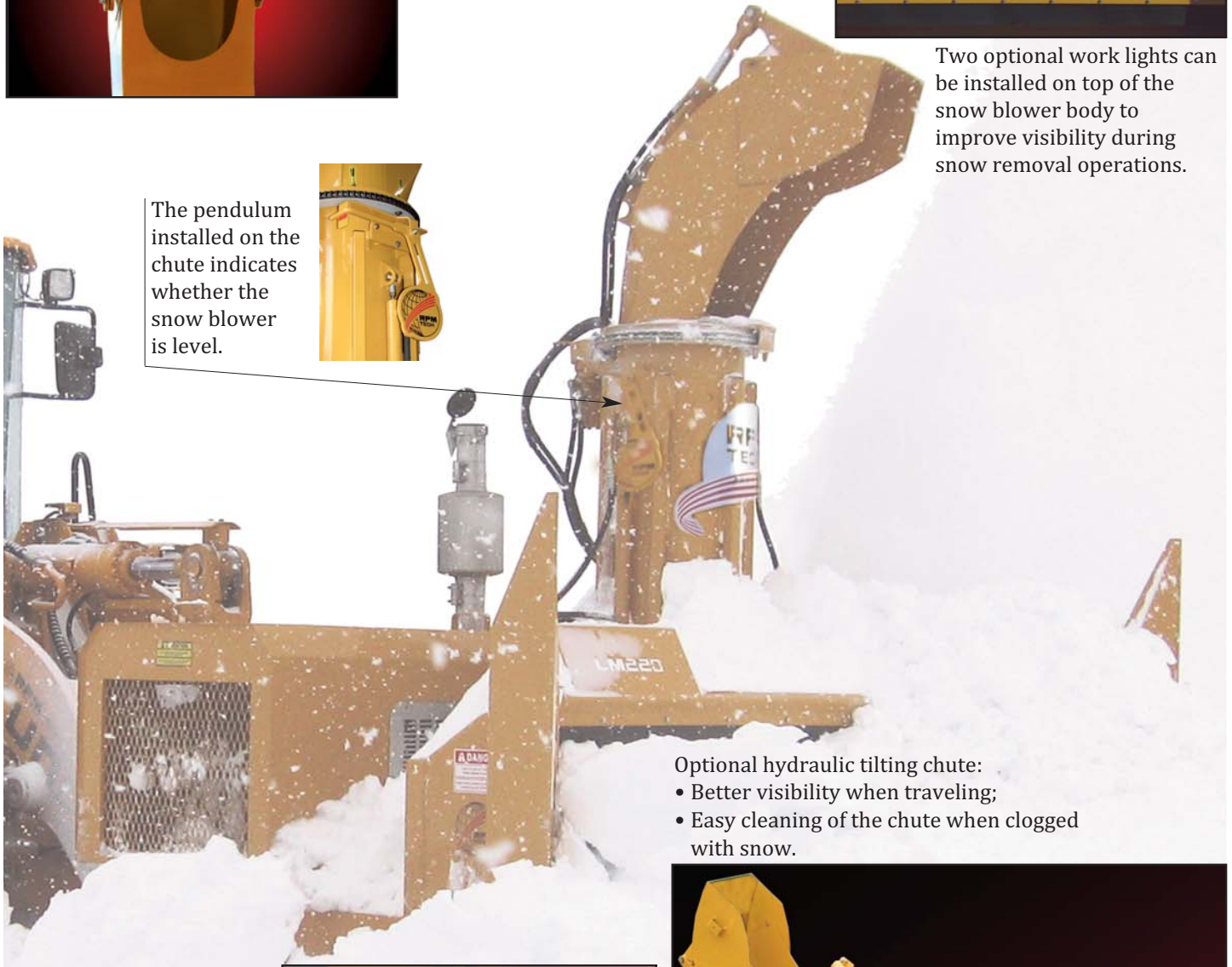
Optional hydraulic tilting chute: • Better visibility when traveling; • Easy cleaning of the chute when clogged with snow.