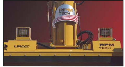
Two optional work lights can be installed on top of the snow blower body to improve visibility during snow removal operations.