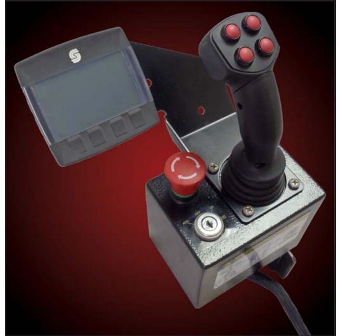
HIGH RESOLUTION GRAYSCALE LCD DISPLAY AND PLUS +1 JOYSTICK FROM SAUER DANFOSS