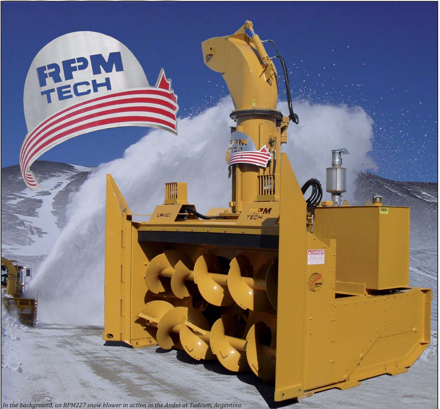
In the background, an RPM227 snow blower in action in the Andes at Tudcum, Argentina.